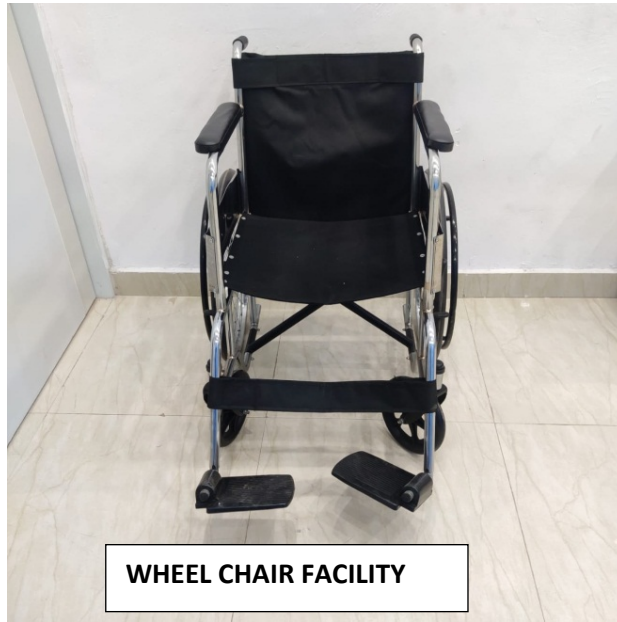
WHEEL CHAIR FACILITY