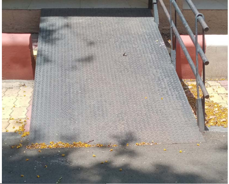
RAMP FACILITY AT ENTRANCE