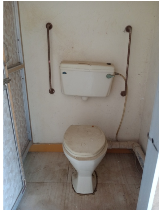
Rest room at ground floor well connected with ramp