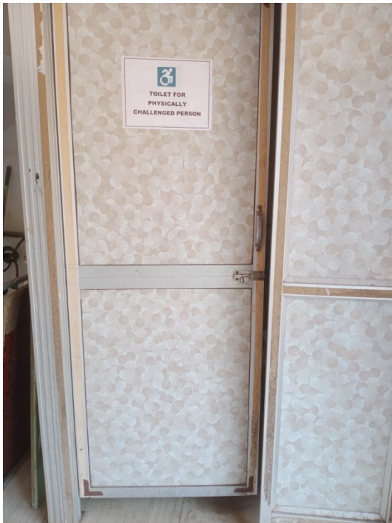
Toilet facility at ground floor well connected with ramp